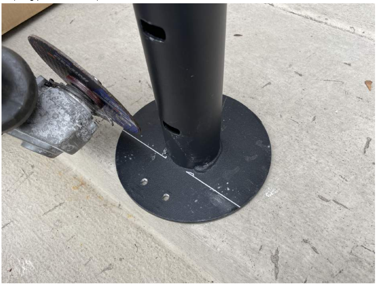
Step 1. Remove 4 legs out of the trampoline boxes. Cut round leg plates as shown in pic 1 and 2. (4 leg plates need cut)

Please read through the entire instructions before beginning step 1.