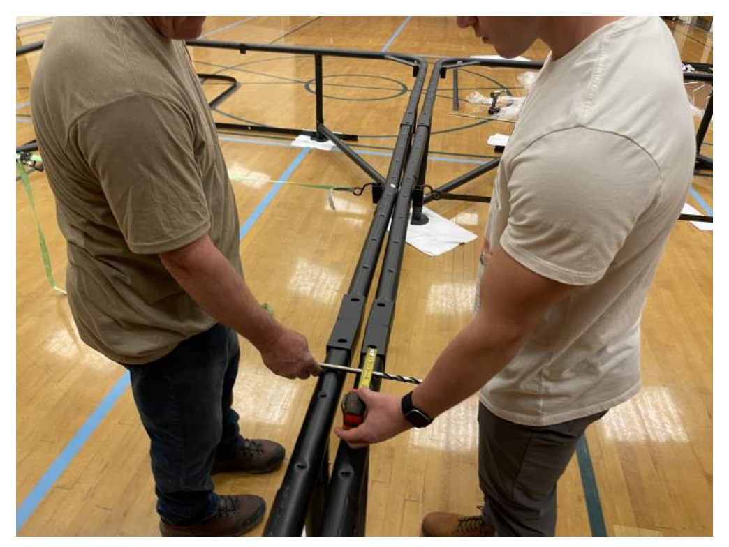
Step 7. Using the "all-thread" and nuts provided in the trampoline kits, bolt together the frames as shown in pic 14 and 15. (5 Locations) We do recommend double nutting each end. Then cut off excess all-thread at the edge of outer nuts. (Thread Lock" would be a good option)