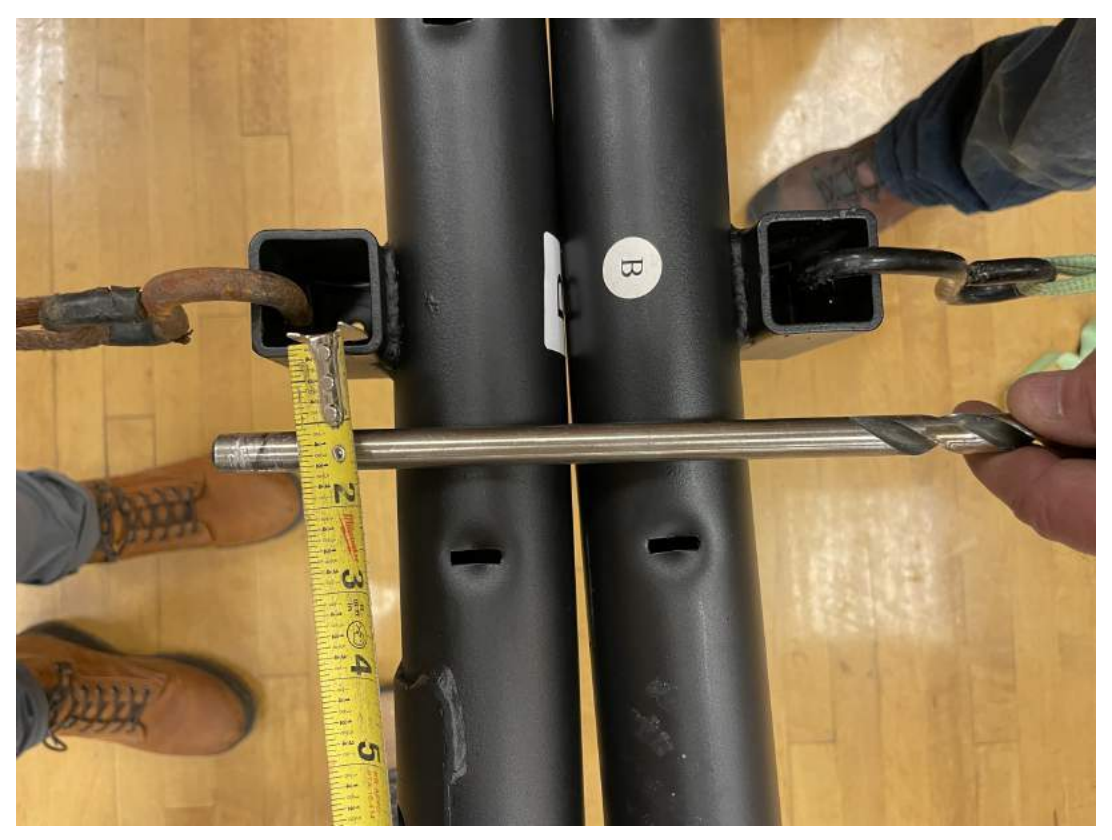
3" away from square main frame bracket and in between this bracket and leg post. Pic 12 and 13. (2 holes)