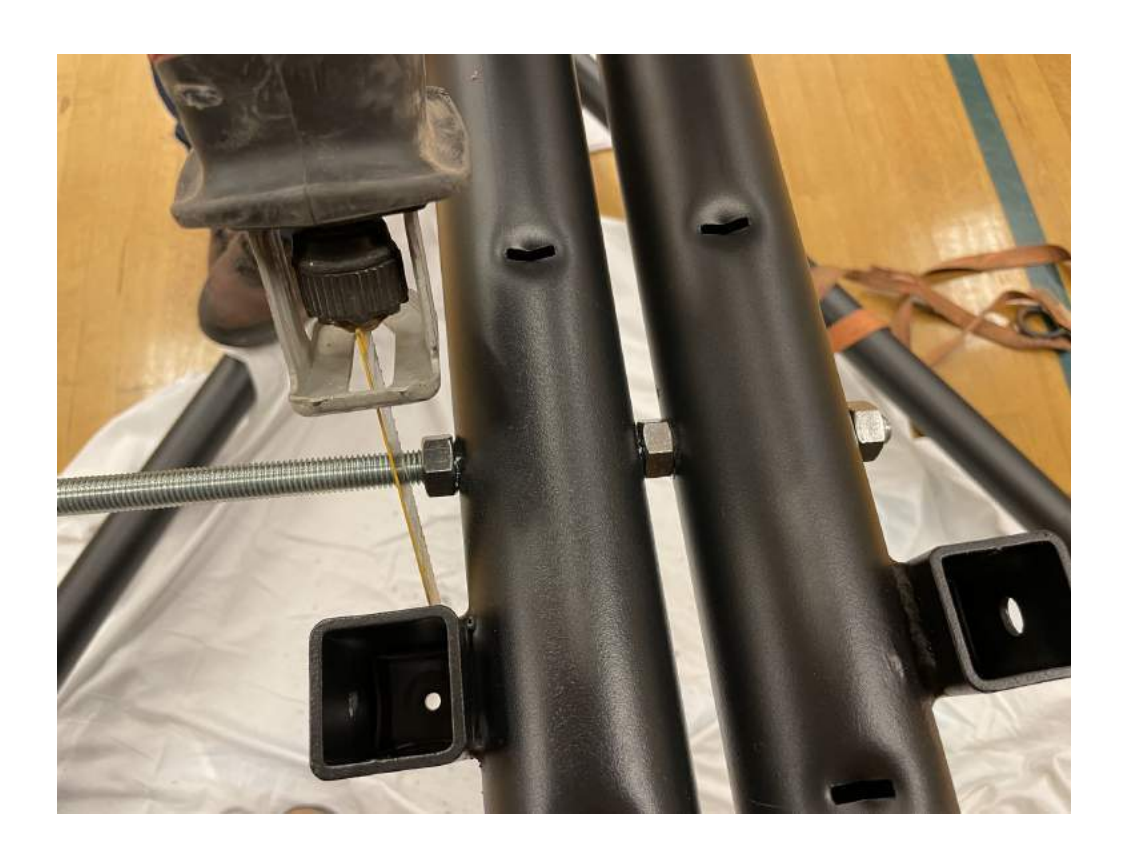
Step 8. Take unused straight lower alignment rail pieces and cut to fit at 51 3/4" as shown in pic 16, 17 and 18. You will then need to re-drill 1/4" holes and bolt rails together.