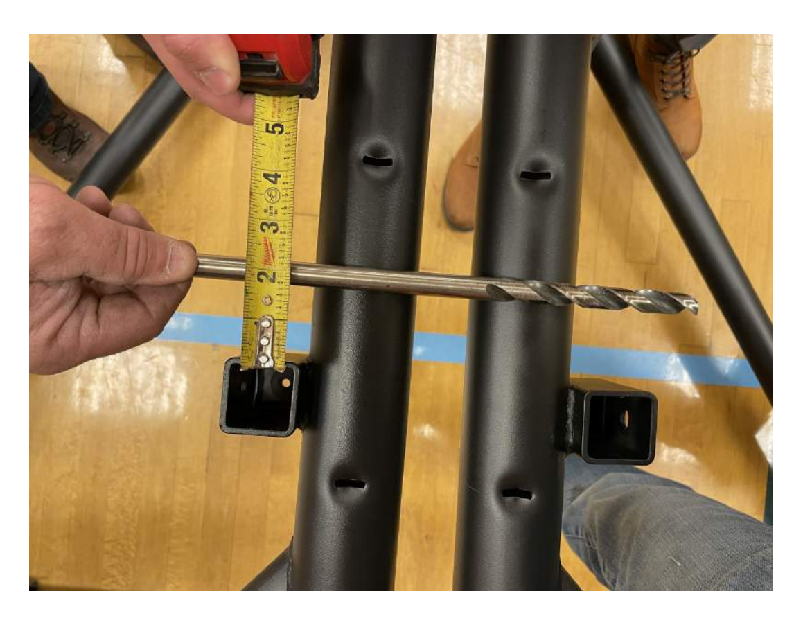
1.5" from center square tubing bracket. Pic 10and 11. (1 hole)