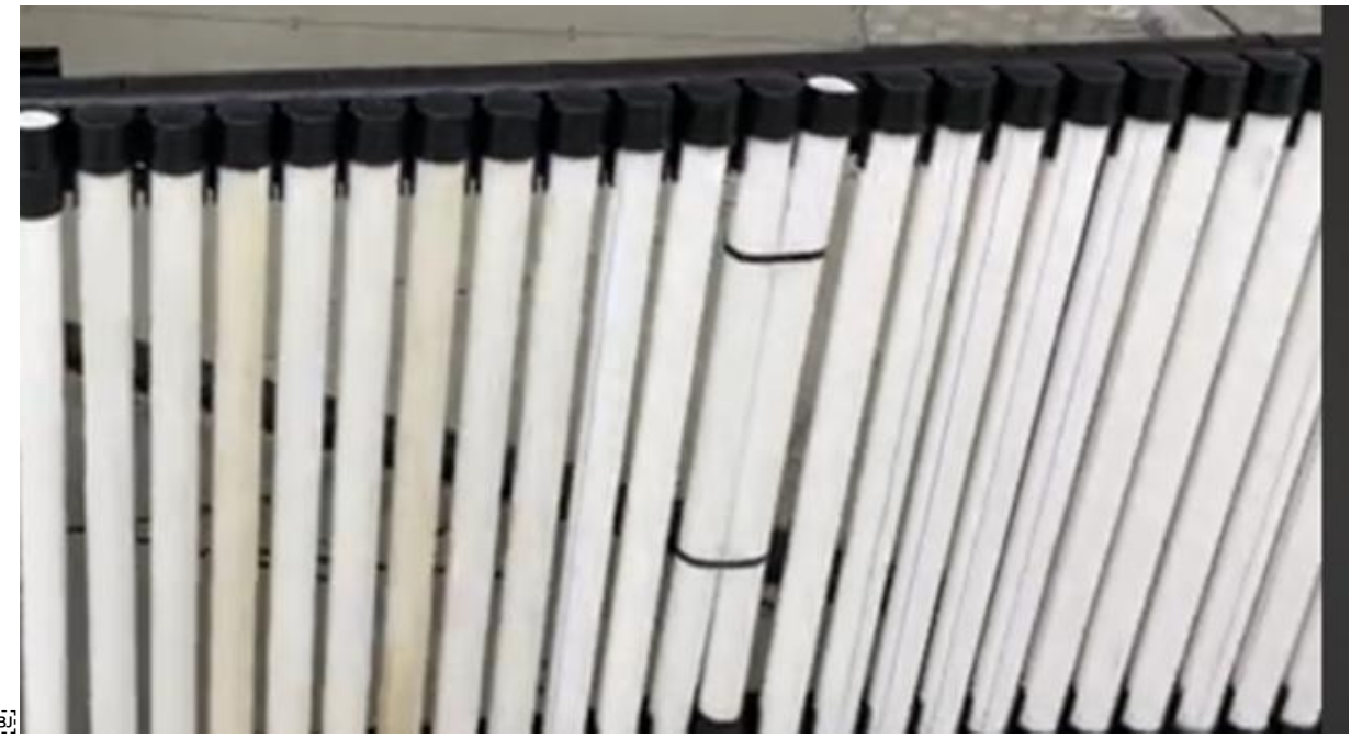
Step 3. Fit, cut and attach the last panel to the frame. Then zip tie the joints together along the end pipes.

Step 2. Start pulling or stretching the panels tight around the trampoline frame. Tighten zip ties as you go around the frame. Do this all the way around the frame.